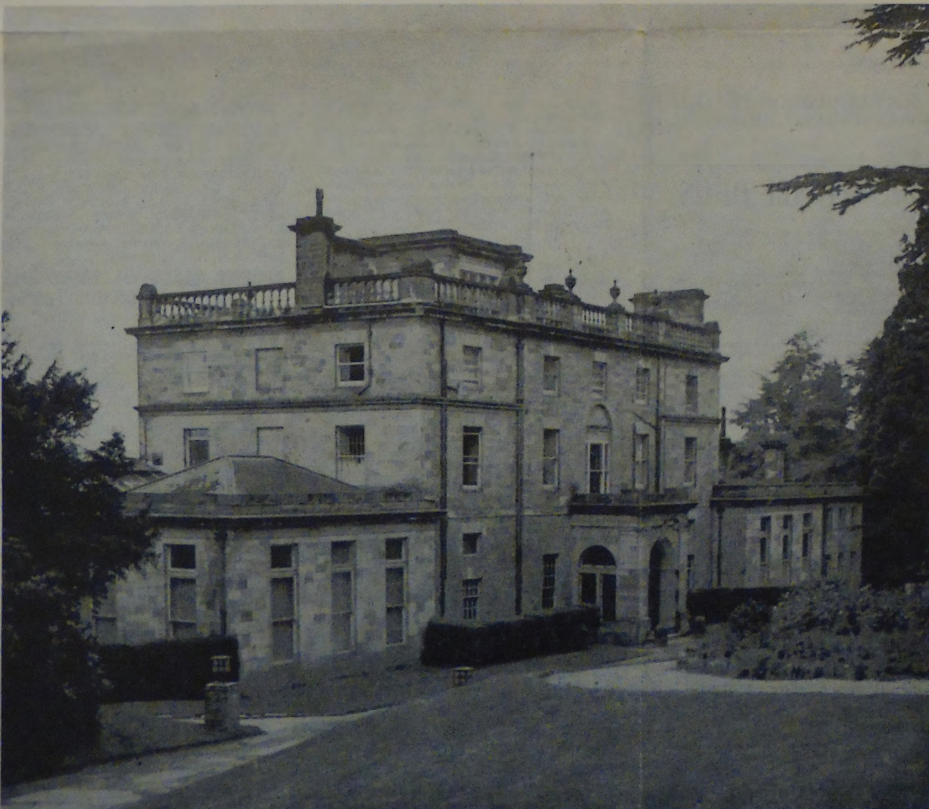
Beautiful Saint Hill Manor, headquarters of Scientology Organization activities throughout the world and location of the famous Saint Hill Special Briefing Course and exciting Power Processing, holds a unique place in the hearts of Scientologists in all parts of the world. A visit to Saint Hill is a major event in the life of every Scientologist. Saint Hill, where dreams come true, and personal freedom and ability ascend to new heights.